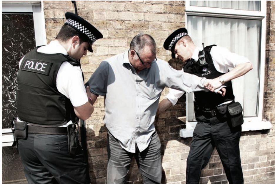
Library image, posed picture